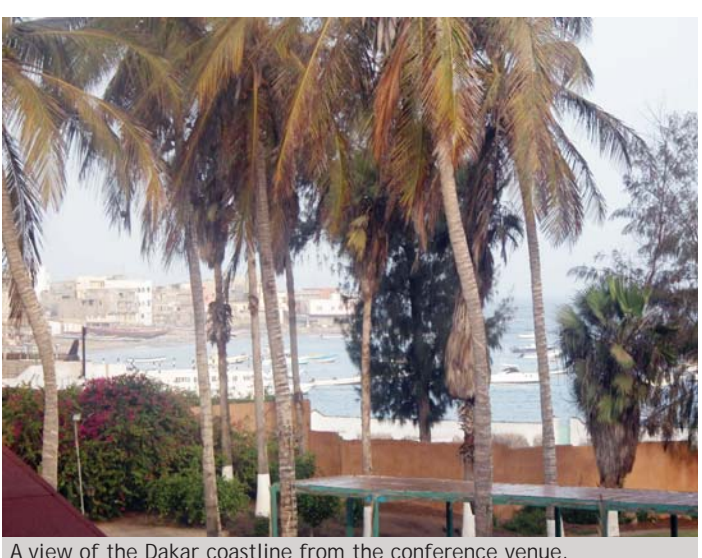
A view of the Dakar coastline from the conference venue.