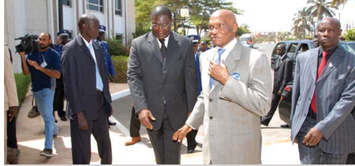
President of Senegal Abdoulaye Wade arrives at le Meridien President Hotel for the Conference.

AFRICA: The first High-level Biofuels Seminar in Africa was held in Addis Ababa, Ethiopia, from 30 July-1 August 2007. The seminar was jointly organized by the AUC, the Government of Brazil and the UN Industrial Development Organization. The seminar concluded with the adoption of the Addis Ababa Declaration on Sustainable Biofuels Development in Africa, and an Action Plan. The Plan encompasses the development