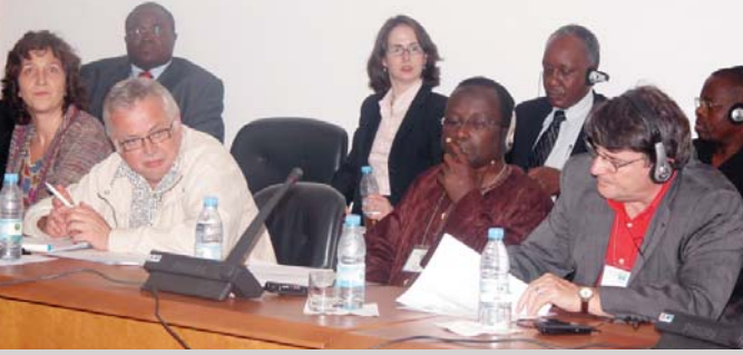
Participants listen intently during the session on investment and financing for scaling up renewable energy in Africa.

INVESTMENT AND FINANCING FOR SCALING UP RENEWABLE ENERGY IN AFRICA: Three parallel sessions were held on investment and financing for scaling up renewable energy in Africa. The session on making carbon finance work for Africa was held on Wednesday evening,